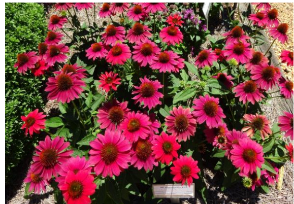
Figure 4. Echinacea Sombrero® ‘Tres Amigos’ - Darwin Perennials.

Echinacea Sombrero® ‘Tres Amigos’ - Darwin Perennials (Figure 4). Show-stoppers are a must for every garden but they can be hard to find if you don’t know where to look, but look no more. Echinacea Sombrero® ‘Tres Amigos’ is going to be your new favorite perennial. Flowers transition thru three distinct colors that emerge from peachy-coral to rose and finish with a hint of burgundy. You would think these kinds of colors are only found in books and movies, but they are real, and this selection is a must for any perennial garden. The plants perform well in full sun and can take drier soil conditions. Leave the flowers for the goldfinches to enjoy late in the season.