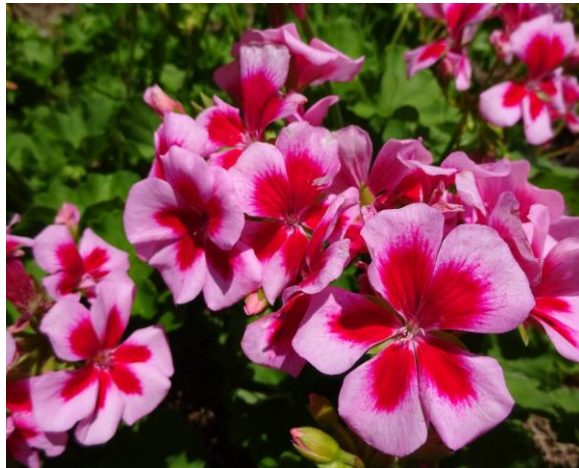
Figure 8. Pelargonium Calliope ® ‘Large Rose Mega Splash’ - Syngenta Flowers.

Geraniums tend to do either great or not so good here in the south. Calliope® ‘Large Rose Mega Splash’ from Syngenta Flowers tops the list in the great category. Super showy pink petals with rose starbursts from the center of the flowers are sure to please in containers, hanging baskets, or in-ground plantings. Production of flowers has been non-stop. This cultivar has been the best of all our Geraniums this year and it has maintained excellent disease resistance even with a wetter than usual summer in Athens, Georgia.