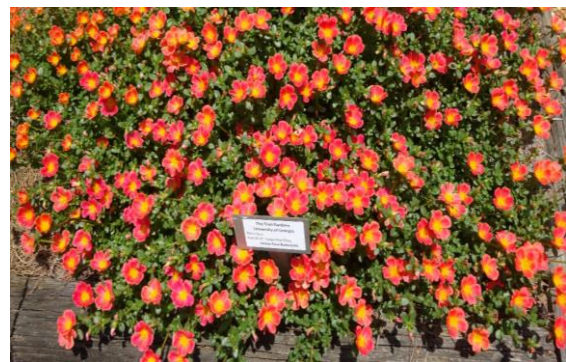
Figure 10. Portulaca Hot Shots ™ ‘Tangerine Glow’ - Green Fuse Botanicals.

Portulaca Hot Shots ™ ‘Tangerine Glow’ - Green Fuse Botanicals (Figure 10). The winner column this year at the UGA Trial Gardens is packed with superior plants each excelling in a particular way. Portulaca Hot Shots ™ ‘Tangerine Glow’ is in a league of its own in terms of overall interest. Our planting of ‘Tangerine Glow’ took over an area 6’ long by 3’ wide and is just simply beautiful. The added interest of a flower that opens in the morning and closes in the afternoon is just too cool. Bright tangerine petals with scorching yellow centers bloom abundantly like a carpet of wonderfulness that deserves to be in every garden with full sun.