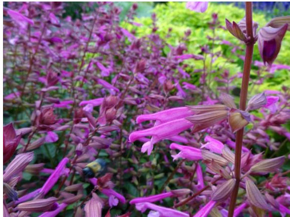
Figure 11. Salvia Skyscraper ™ ‘Pink’ – Selecta.

Salvia Skyscraper ™ ‘Pink’ – Selecta (Figure 11). We all know and love salvia and who would not? They attract bees, butterflies, hummingbirds, and are just downright beautiful with a plethora of colors and sizes to choose from. Selecta struck a vein with Salvia Skyscraper ™ ‘Pink’ and the plant speaks for itself. We are in the business of novel plants and we are all used to blue, purple, and red salvias, but pink? The flowers burst forth with a pale magenta calyx followed by a bright pink corolla that emerges to tower over the lush dark green foliage on this unique cultivar.