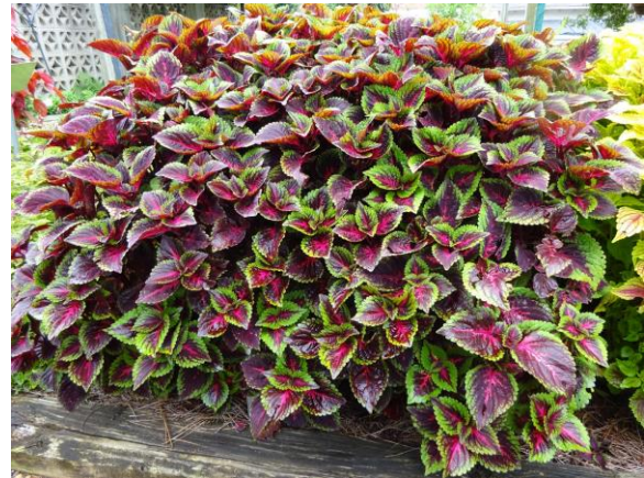
Figure 12. Solenostemon ColorBlaze ® ‘Torchlight’ - Proven Winners.

Solenostemon ColorBlaze ® ‘Torchlight’ Proven Winners (Figure 12). The ColorBlaze ® Series has been nothing short of spectacular this year so the top pick from this category had to be nearly perfect. ‘Torchlight’ has superior qualities in every way, from its lush storybook- like green with red and hot pink veined leaves to its seemingly indestructible growth habit. This plant is also very responsive to trimming. Every time we pruned the plants the new leaves came back with increased color. When 2019 comes around get this plant first and use it in multiple plantings.