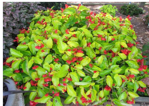
Figure 1. Begonia 'Canary Wings' - Ball Ingenuity.

Begonia 'Canary Wings' - Ball Ingenuity (Figure 1). It's refreshing to relax in the shade with a nice glass of sweet tea here in Georgia...then you spot Begonia 'Canary Wings' from Ball Ingenuity and all the sudden you have the excitement and vigor to go forth and conquer the world! Well the plant world that is. We have been watching this novel shade begonia in the garden since day one. To our satisfaction shady areas become bright and vibrant with Canary Wing's chartreuse leaves and bright red flowers. It is an exceptional plant for both containers and in-ground plantings.