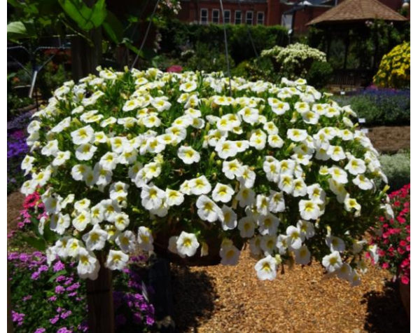
Figure 3. Calibrachoa Lia™ ‘White’ – Danziger.

Calibrachoa Lia™ ‘White’ – Danziger (Figure 3). Hanging baskets bring brilliant color to eye level and are a staple form of growing plants around the country. Calibrachoa Lia™ ‘White’ from Danziger sets the bar for other Calibrachoa ’s with its nearly perfect shape as it has been in full bloom for months. Medium-sized pure white petals with yellow throats are anything but just another white flower in the garden. Anybody wanting to have constant color needs Lia™ ‘White’ added to their hanging baskets or mixed planter’s as white is an essential color to make all other colors pop.