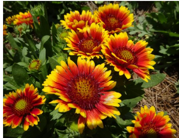
Figure 6. Gaillardia SpinTop TM 'Red Starburst' - Dummen Orange.

Gaillardia SpinTop TM 'Red Starburst' - Dummen Orange (Figure 6). Gaillardia SpinTop TM 'Red Starburst' from Dummen Orange just makes people smile. The flowers on this plant exude color with their red centers that burst into a red/orange and finish with bright yellow tips. This plant would make an excellent border plant or container planting. This selection needs to be beside your front door so you can get a little burst of happiness whenever you walk by!