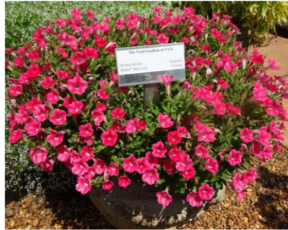
Figure 9. Petunia Dekko ™ ‘Star Coral’ - Syngenta Flowers.

well to just about any other range of colors as companion plants, not to mention how well it performed in a standalone planter.