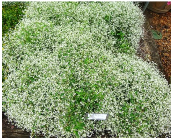
Figure 5. Euphorbia Crystal White TM - Green Fuse Botanicals.

Euphorbia Crystal White TM - Green Fuse Botanicals (Figure 5). Euphorbia is a well-known landscape plant, especially in hot parts of the country where it thrives. Crystal White TM from Green Fuse Botanicals has a desirable shape that's about half the size of other popular varieties on the market. Only about a foot tall - it packs a punch with flower production and has very tight branching. The plant was blooming in April when it was planted and was still in full bloom going into September – very nice!