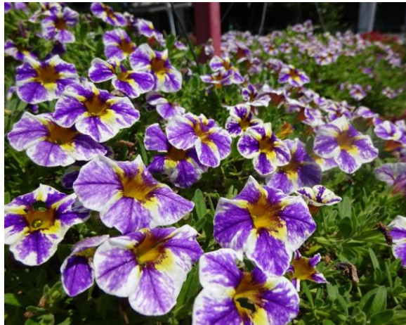
Figure 2. Calibrachoa Superbells® ‘Holy Smokes!’ - Proven Winners

Calibrachoa Superbells® ‘Holy Smokes!’ - Proven Winners (Figure 2). ‘Holy Smokes!’ is what you say when you lay your eyes on this beauty from Proven Winners Superbells® Calibrachoa collection. Summer longevity is a must for the Southeast as we have a growing season that can be stretched out over 25 weeks. So, for any plant to maintain interest over such a period of time it’s got to be a stunner and ‘Holy Smokes!’ did it like a champ. White petals with what seem to be watercolor-like purple/blue swatches and yellow centers. It maintained a mounding habit throughout spring and summer that made it without doubt one of the showiest flowering plants in the garden.